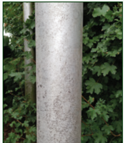
▶ 1 month after treatment