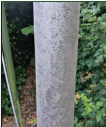
▶ A few hours after treatment