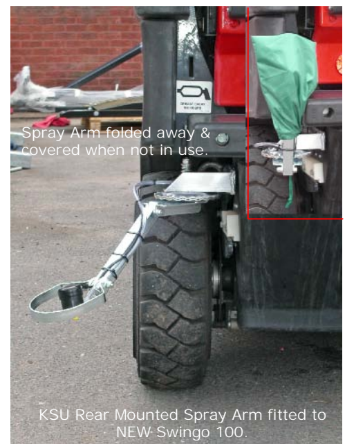
Spray Arm folded away & covered when not in use.