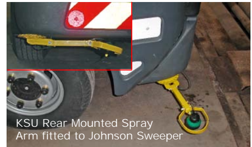
KSU Rear Mounted Spray Arm fitted to Johnson Sweeper