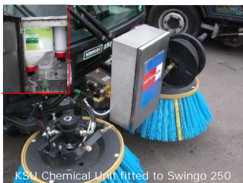
KSU Chemical Unit fitted to Swingo 250

For Further Information Please Call 01952 641949